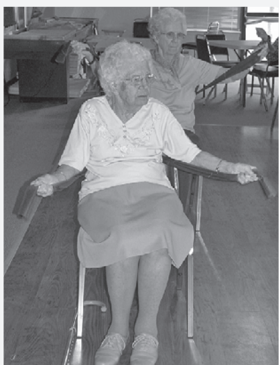
Residents participating in exercise program